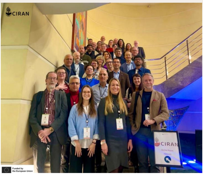
CIRAN Consortium and External Experts in Ljubljana (Slovenia). @CIRAN