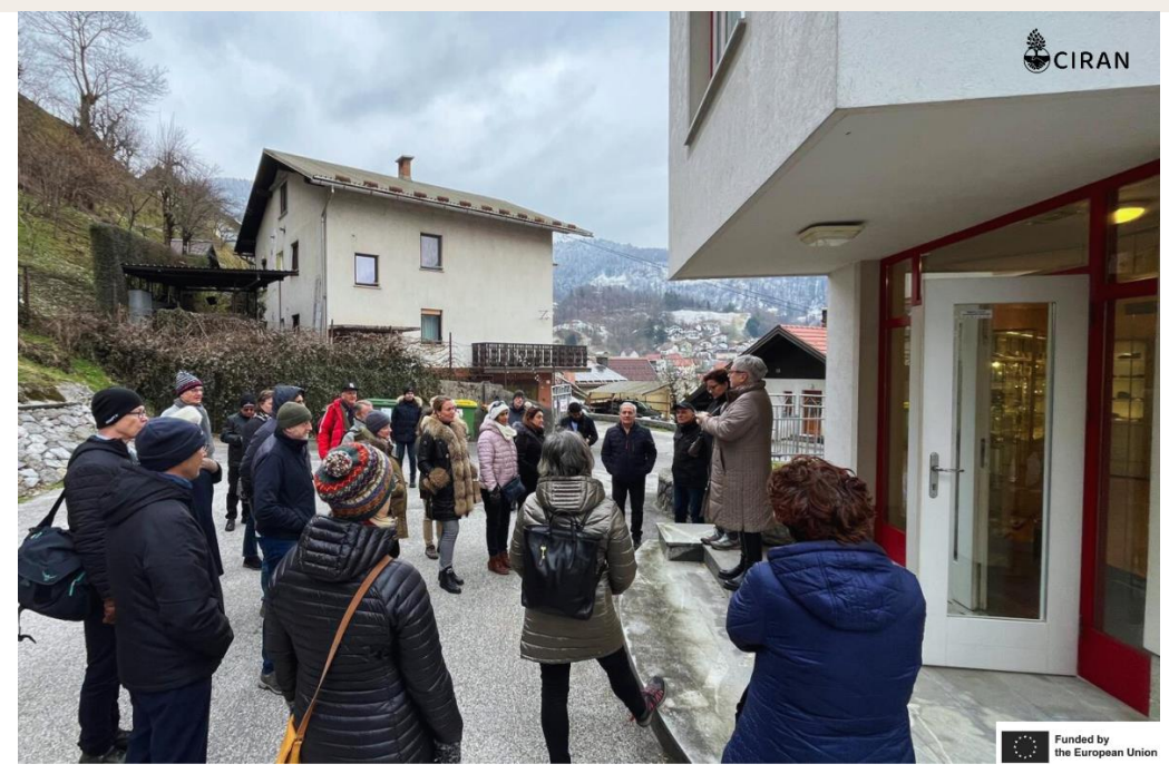
CIRAN Consortium and External Experts at the Idrija UNESCO Global Geopark (Slovenia).