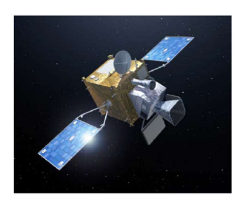
Sattelites and spacecrafts